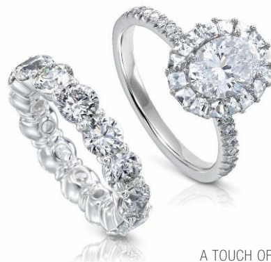
A TOUCH OF CLASS Give yourself at least six months to choose your wedding bands and wedding day accessories. Razny Jewelers, razny.com

There's plenty to do before saying "I do." Our year-long breakdown will help keep you organized and sane throughout the whole process.